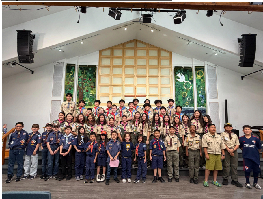
Scout Sunday 2026 (just missing Junior GS 5365)

Pay attention to whose voices are missing in your circles—church, work, media. Ask: Who isn’t being seen? And how can I help lift the basket?