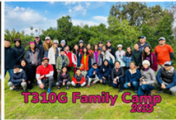
T310G Family Camp 2023